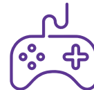
VIDEO GAME TESTERS (QA)